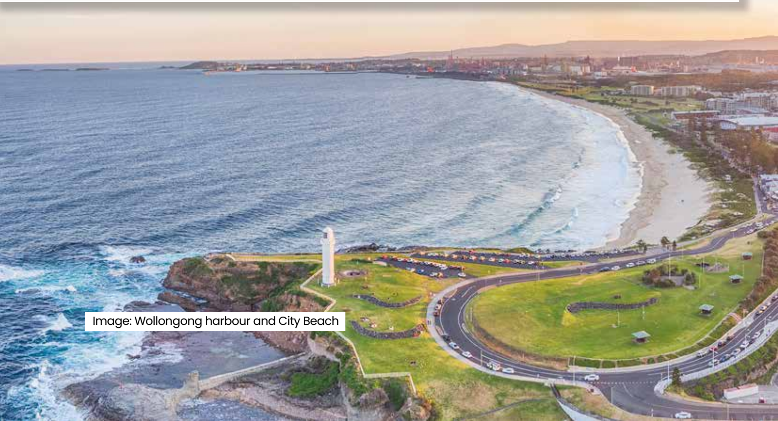
Image: Wollongong harbour and City Beach

A large proportion of this new A-grade stock has been tenanted and the pipeline offers any new incoming tenants a range of opportunities to locate in high quality premises within the Wollongong CBD.