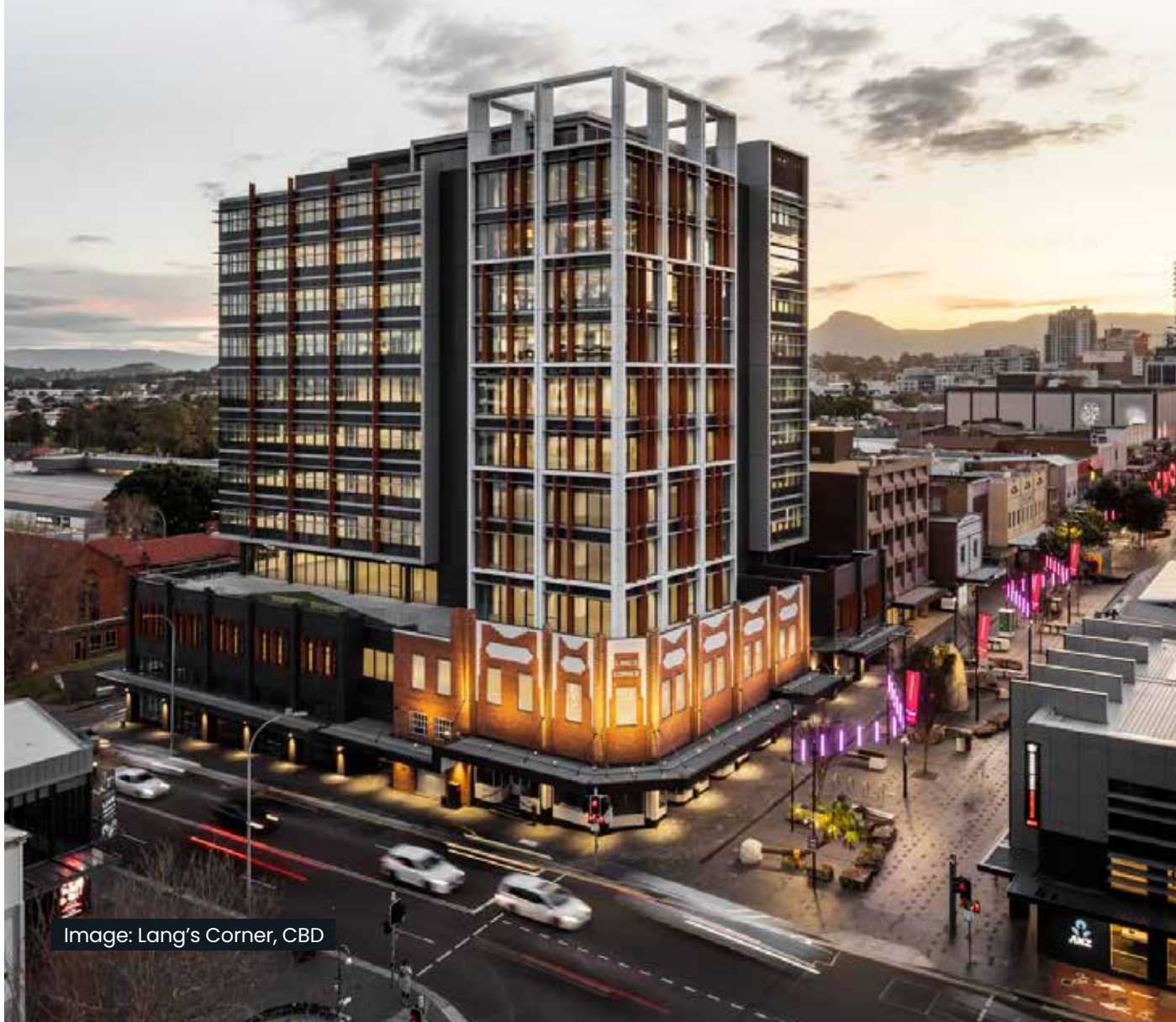
Image: Lang's Corner, CBD

The Wollongong CBD has seen some exciting office space constructed over recent years, including Wollongong's largest A-grade commercial building, Lang's Corner. This purpose built 12 storey commercial development includes 12,000sqm of pure commercial office space and is home to Mercer – a global asset management firm.